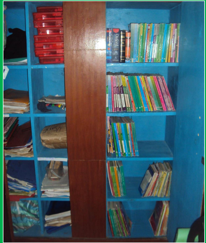
Above: the Kathy and Mike McNulty Academy school library. Currently more than 150 story books, course books, and teacher guides are available to the students, faculty, and staff of KMMA.

The library now has 150 books – including story books, course books, and teacher guides – chosen by the KMMA faculty. It is open during school hours, and students can check out items for up to one week. If you would like to help purchase more resources for the library, you can do so by visiting kmma-caiths.org and clicking on the DONATE button. Unfortunately, we can no longer carry books to Kenya due to new tariff enforcement.