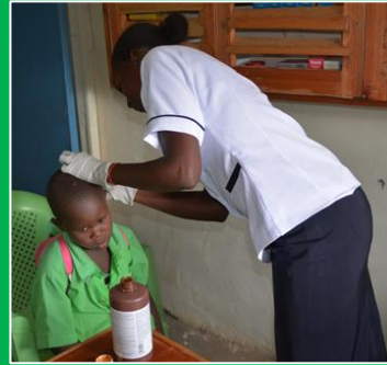
Left: a student at KMMA being treated by the full-time nurse at St. Patrick Clinic without having to be taken out of school.

Clinical services are free to all students at KMMA, and already the access to health care has made a noticeable difference in school attendance and performance. Local community members can also receive care at St. Patrick Clinic, but are asked to pay (at cost) for medications they receive. Since the clinic opened, more than four hundred patient visits have been logged. Truly, the St. Patrick Clinic is a blessing to the Rusinga community!